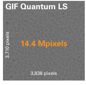
Figure 1. At 23.6 megapixels (Mpixels), BioContinuum provides 1.65 times the throughput of the GIF Quantum LS imaging filter (pixels/frame).

easier for both novice and expert users. With a single click, smart algorithms shorten the time to fully tune your filter and deliver reproducible results across your short- and long-term studies. Furthermore, the system uses automated zero-loss tuning routines to condense the time necessary to touch-up the image alignment.