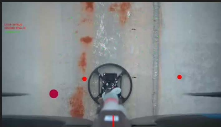
UT Waveform Data