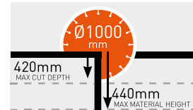
MAX CUT DEPTH - JUMBO 1000