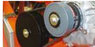
CENTRIFUGAL CLUTCH DEVICE (JUMBO P13 ONLY)