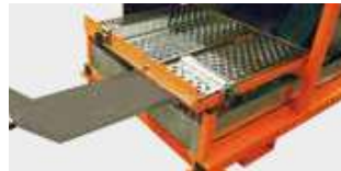
FRONT SPLASH GUARD