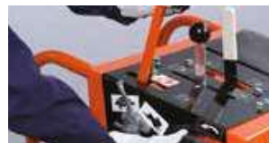
MANUAL OR HYDRAULIC RAISE & LOWER THE BLADE