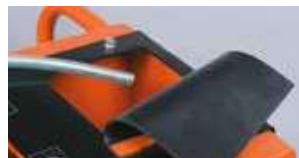
BUILT-IN WATER TANK