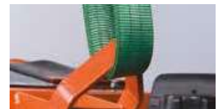
BUILT-IN LIFTING EYE